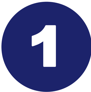
Cumulative Staff Cases (since 9/1/20)