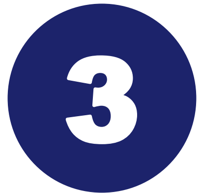
Cumulative District Cases (since 9/1/20)

Cumulative = total number of cases from the start of school