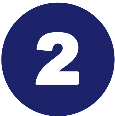
Cumulative Student Cases (since 9/1/20)

Active = individuals who are confirmed positive or presumed positive and currently in the isolation protocol.