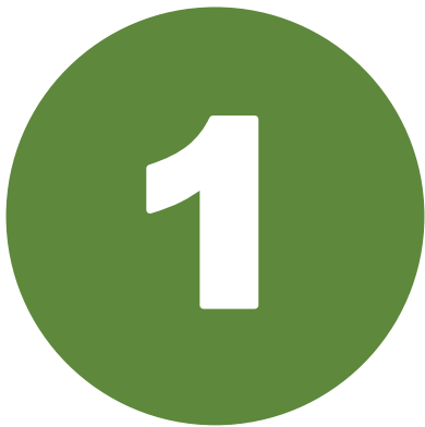
Active Student Cases